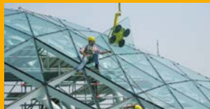
SEALING AND BONDING